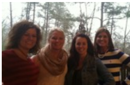
Friends on a weekend PLC outing